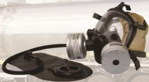
带饮水装置球形全面罩防毒面具 Spherical Full Face Mask Respirator with drinking device