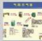
充气站使用说明书 Inflation station use manual