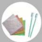
镜片擦拭布 / 擦拭清洁棒 Lens wiping cloth/wipe clean stick