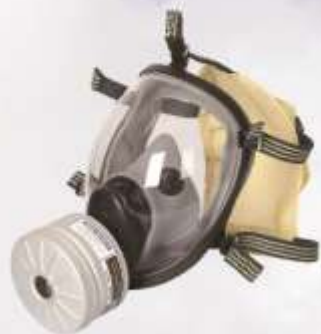
单罐球形全面罩防毒面具 Spherical Full Face Mask Respirator with single canister