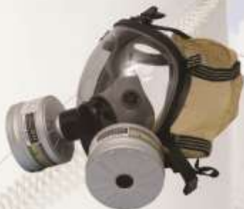
双罐球形全面罩防毒面具 Spherical Full Face Mask Respirator with double canisters