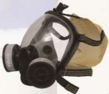
双罐球形全面罩防毒面具 Spherical Full Face Mask Respirator with double cartridges