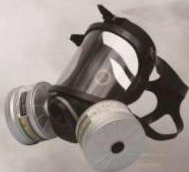
雙罐裝材料半面罩呼吸器 Cylindrical Full Face Mask Respirator with double canisters