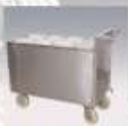
气瓶车 Cylinder cart