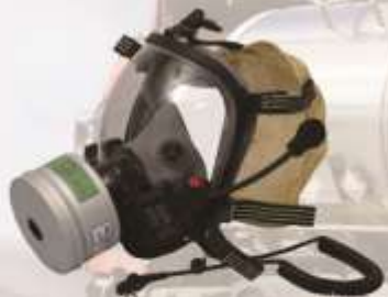
通讯防毒全面罩防毒面具 RW-6200 Communication Full Face Mask Respirator