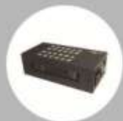
锂电池充电器 Battery charger