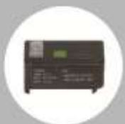
备用锂电池 Speed thru battery