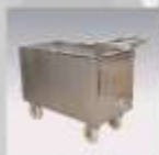
气瓶运输车 Cylinder transport cart