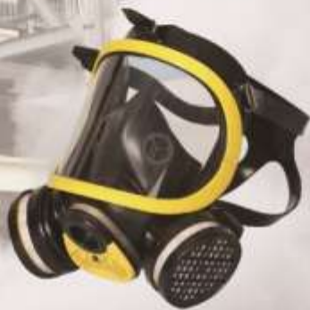
雙罐裝材料半面罩呼吸器 Cylindrical Full Face Mask Respirator with double canisters