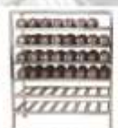
气瓶车 Cylinder cart