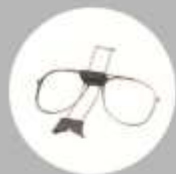
眼镜框架 Eyeglasses frame