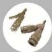
Y型三通 Y-shape connector