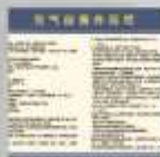
充气站使用说明书 Inflation station use manual