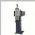
气瓶站 Cylinder station