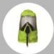
钨钼头盖 Bucky brushing head