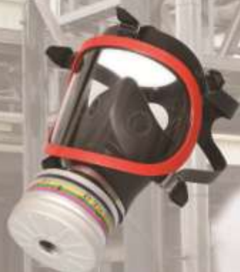
單罐裝材料半面罩呼吸器 Cylindrical Full Face Mask Respirator with single canister