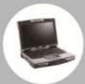
后背指挥系统 Backfield command system