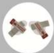
平视透视镜保护膜 HUT-1000 protective film