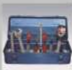
充气工作站 Inflation workstation