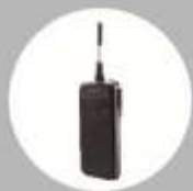
后背中继站 Backfield relay station