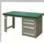
充气工作台 Inflation operation workstation